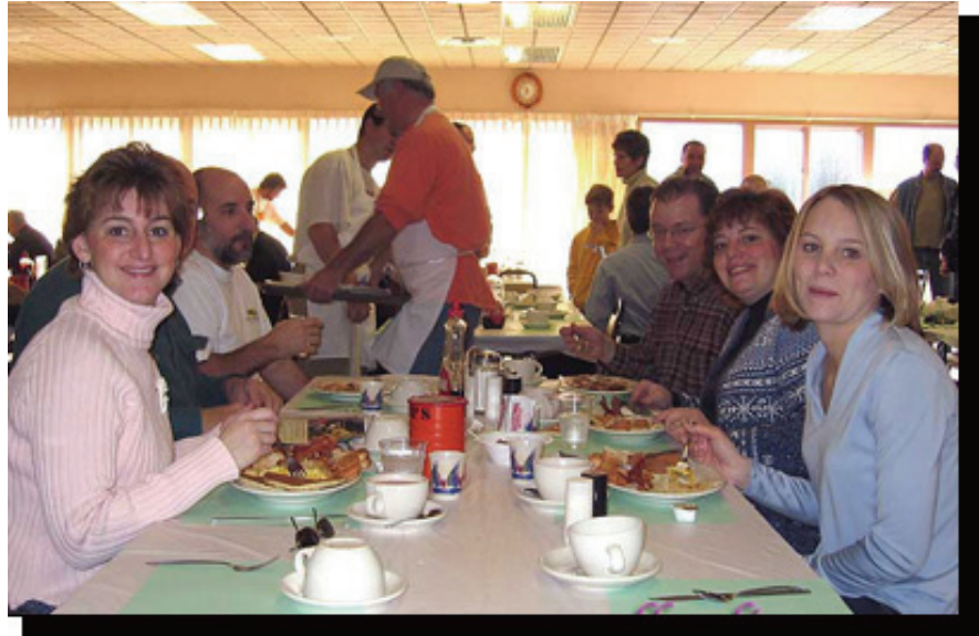
Patrons from a past Sunday Breakfast

Our club started holding Sunday breakfasts over 40 years ago. When we started, the only choice we offered was Pancakes and Sausage.